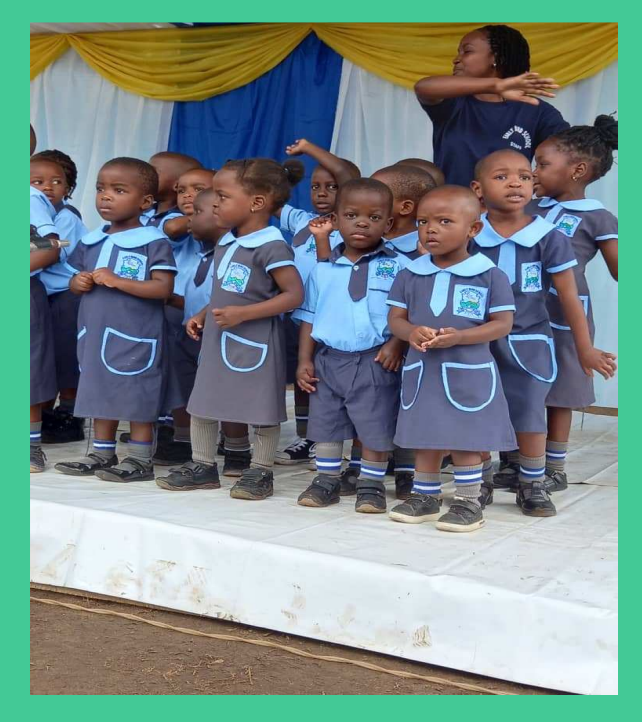
The Music Festival at Early Bird Education Center