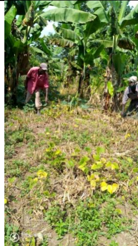
Beans ready to be harvested