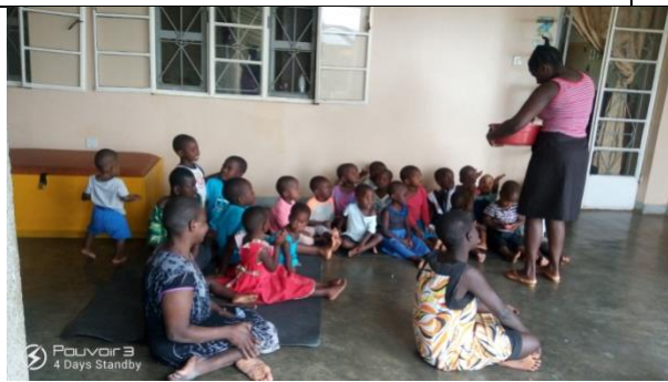
Time for eating fruits