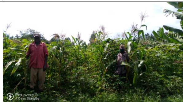
Maize and cassava garden