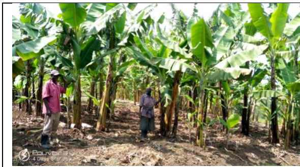
The farmers weeding beans