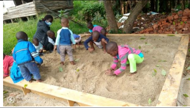
The Children making cakes from sand