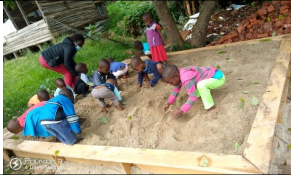
Our sand pit was filled now