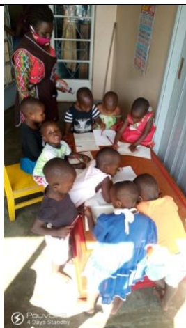
The children in the drawing class