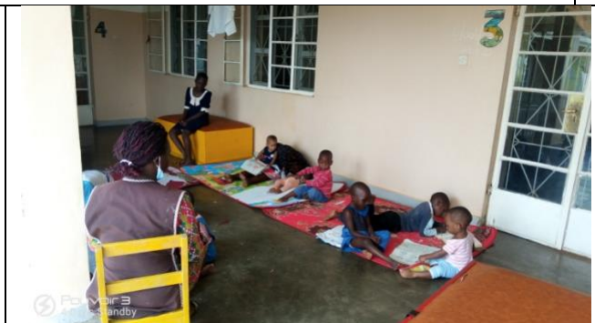
Children with the picture books reading