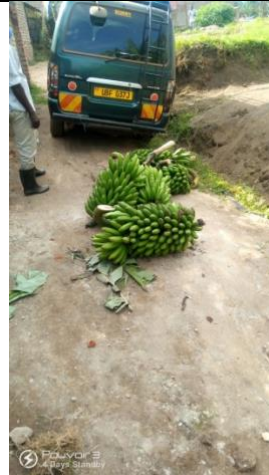
Matooke from Kagote